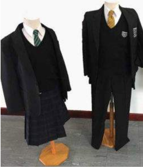
1. Correct Uniform